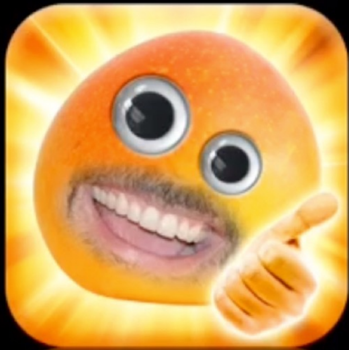
Funny Movie Maker

Another app that provides me with hours of creative fun is... “Funny Movie Maker”.