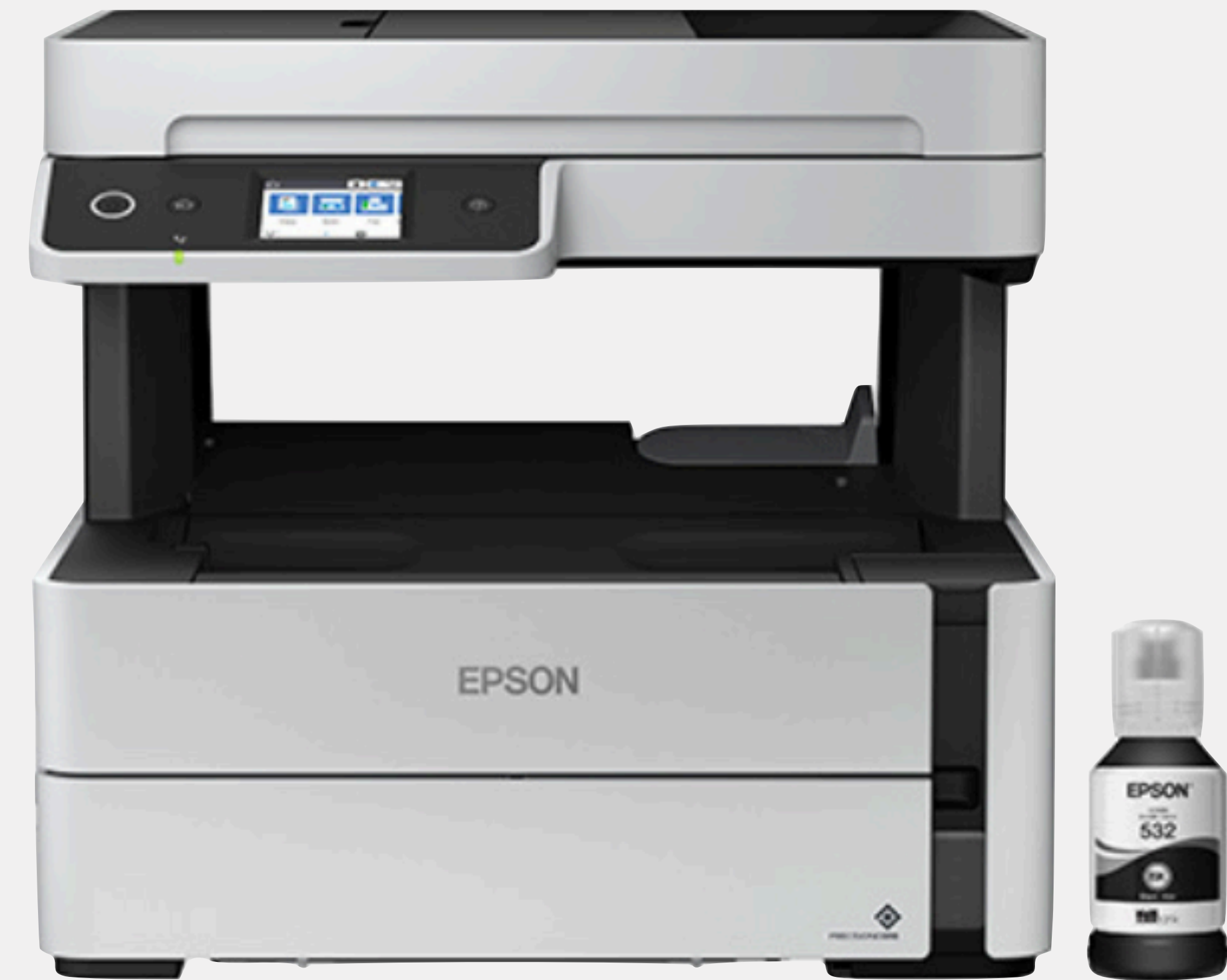
EcoTank ET-M3170 Wireless Monochrome All-in-One Supertank Printer $399 MSRP