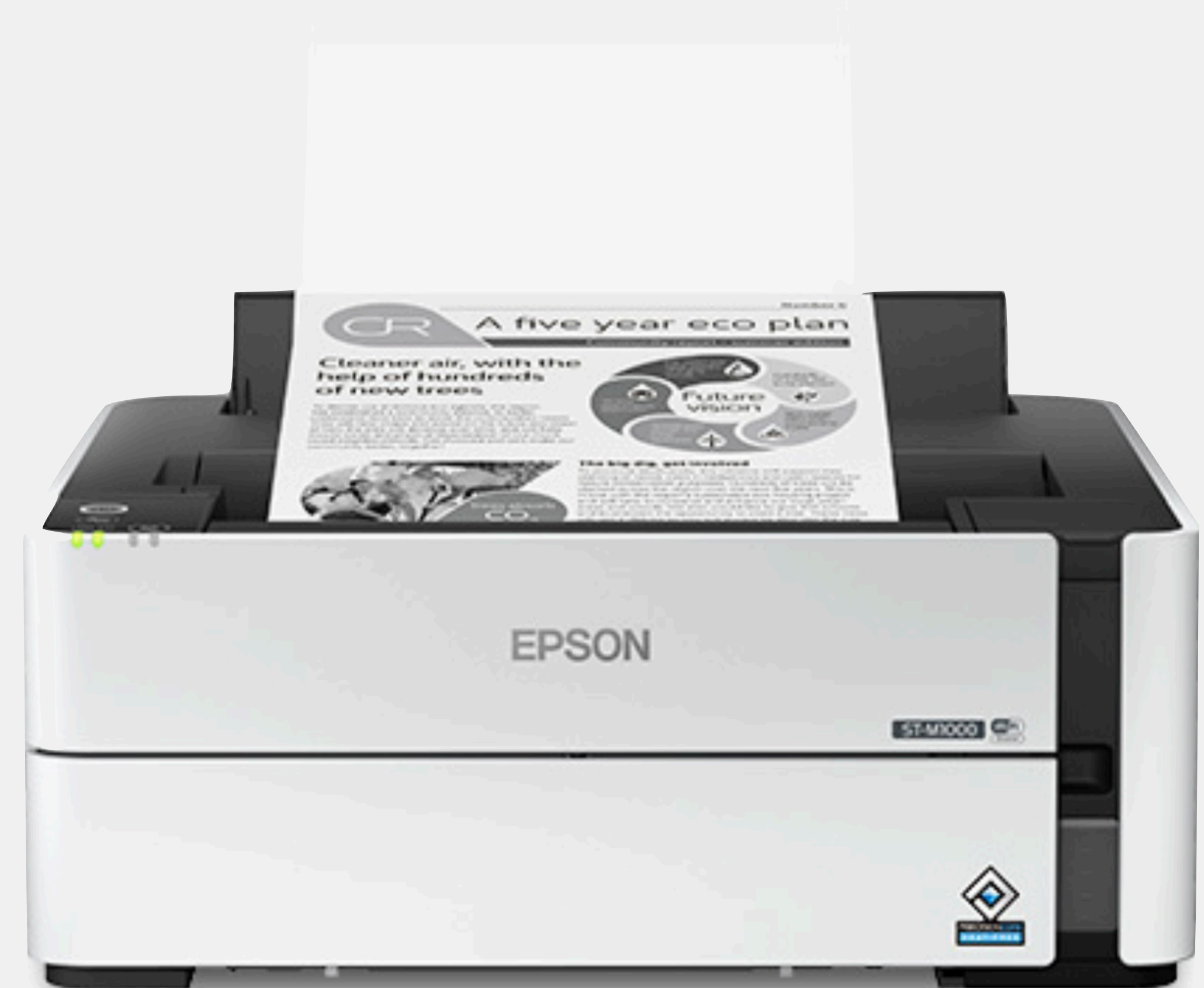
Epson WorkForce ST-M1000 Monochrome Supertank Printer $279 MSRP